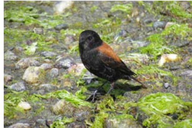
Austral Negrito (Lessonia rufa)

Sailing along the Beagle Channel, we will look into the small bays, where sea ducks dominate – the Flying Steamer-Duck ( Tachyeres patachonicus ), patrolling its coastline stretches and the Flightless Steamer-Duck ( Tachyeres pteneres ) tooting proudly on the border of water and rocks. Above the giant mountains look for the mysterious, great predator, the Black-chested Buzzard - Eagle ( Geranoaetus melanoleucus ). When we reach the Estancia Yendegaia we will forge ahead, crossing slopes covered with thick bushes in search of Austral Negrito ( Lessonia rufa ), a beautifully coloured bird, whose feeding grounds are next to small buildings. We will check to see if the tiny Thorn-tailed Rayadito are nesting again in a small hollow, and that the beautiful Patagonian Sierra-Finch ( Phrygilus patagonicus ) forages among inaccessible spiked Berberises.