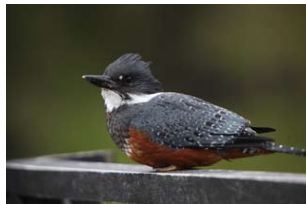
Ringed Kingfisher ( Ceryle torquata )