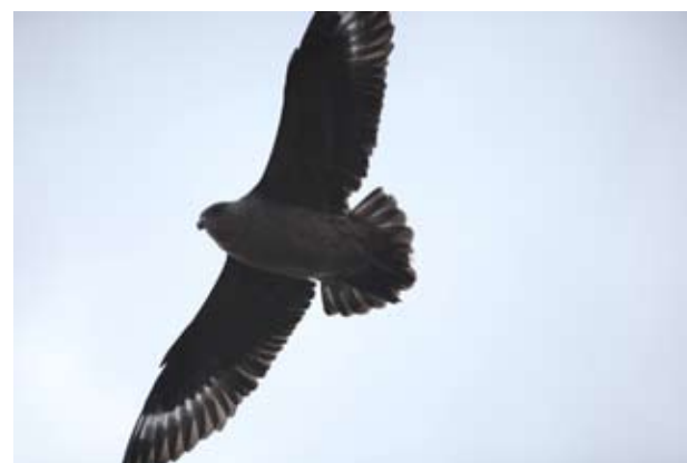
Chilean Skua ( Catharacta chilensis)

where we will meet the Pacific. Moving westwards to the open waters of the Pacific we will begin to look for albatrosses and other procellariiformes. Certainly here we will see the Blackbrowed Albatross ( Thalassarche melanophiris ) and we will attempt to read its bird bands. Maybe we will discover something new about our air-borne friends, their long journeys ahead of them, their homelands, our wish to connect and understand them. Here we have a chance also to see the Grey-headed Albatross ( Thalassarche chrysostoma ), as well as the huge Wandering Albatross ( Diomedea exulans ) and in the advent of favourable weather there is a chance to spot a beautiful Light-mantled Sooty Albatross ( Phoebastria palpebrata ). Whilst luring albatrosses we are likely to attract the Southern Giant Petrel ( Macronectes giganteus ) and the Northern Giant Petrel ( Macronectes halli ). The Chilean Skua ( Catharacta chilensis ) will be our constant companion and will beg us for our last biscuit crumb... And yet more surprises await us: little petrels, terns and all the sea birds that will arrive on the unknown winds.