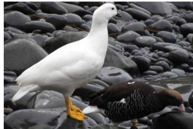
Kelp goose ( Chloephaga hybrida )

Whilst sailing towards the Garibaldi glacier, keep an eye on the splitting waves on the bow, where you may be lucky enough to spot Peale's Dolphin ( Lagenorhynchus australis ) and a small Rookery of Magellanic penguins ( Spheniscus magellanicus ). In the bay, observe the cormorants nesting on the high rocks. If the ice pack is not too dense we can take the dinghy to visit the colony of Rock Shag ( Phalacrocorax magellanicus ) and Imperial Shag ( Phalacrocorax atriceps ). We will encounter the Kelp goose ( Chloephaga hybrida ) along the craggy banks, its sexual dimorphism immediately evident. The male snowy white, the female black as coal with white flecks. One could easily mistake them for different species.