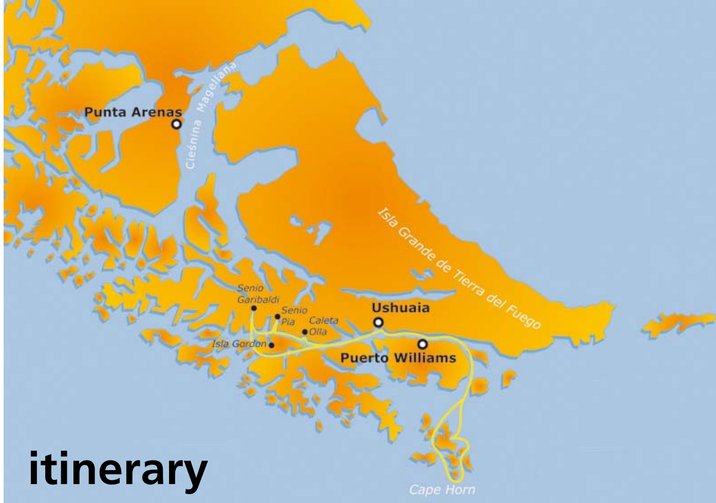
Tierra del Fuego – the end of the world