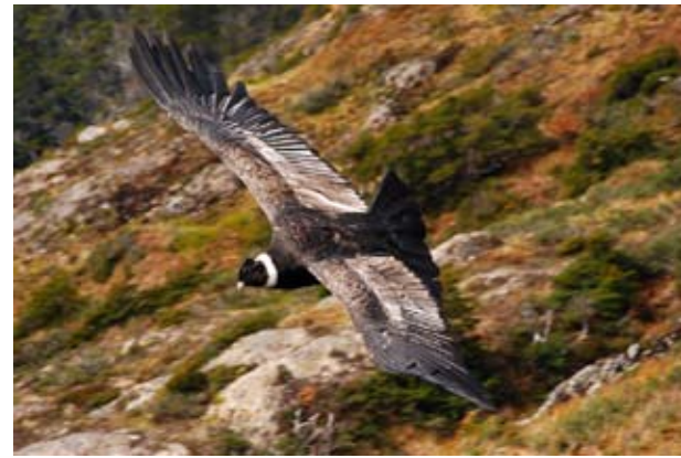
Andean Condor ( Vultur gryphus )

Once the anchor has been dropped, the Caracara Southern Crested ( Caracara plancus ) and the Chiamango Caracara appear on the beach. Rufous-chested Plover ( Charadrius modestus ) sprint along the rocky beaches. Whilst wandering around extensive beaver colony, we may meet the Speckled Teal Duck ( Anas flavirostris ), which leads its chicks here. South American Snipe ( Gallinago paraguaise ) and Fuegian Snipe ( Gallinago strickle ) wade in the drying channels of the mud flats. In the undergrowth white orchids ( Codonorchis ) and yellow orchids ( Gavilea lutea ) grow.